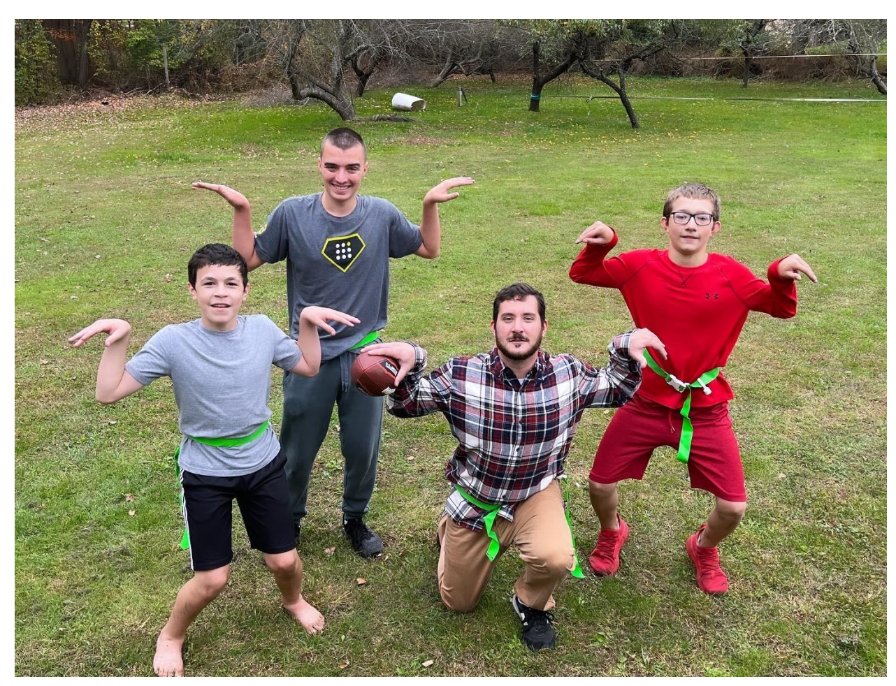
The Flying 9er's!